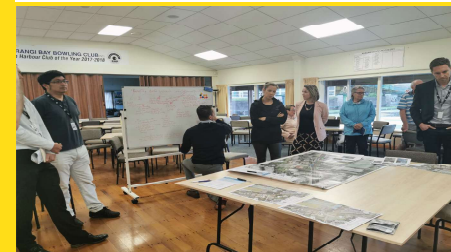
Ramsgate Terrace AT Drop-in Session