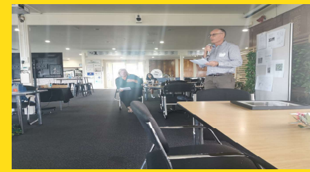
Centennial Park Bush Society Healthy Park Award