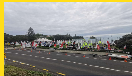
Sir Peter Blake Regatta Waiake Beach