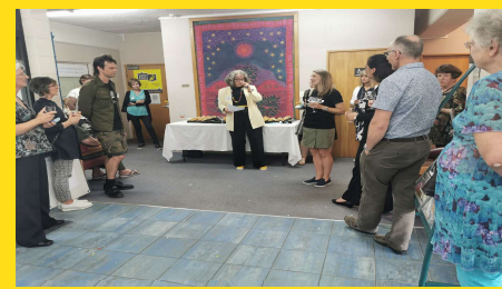
Heart of the Bays end of year nibbles