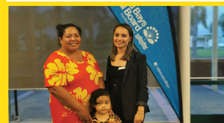
Citizenship Ceremony Orewa College