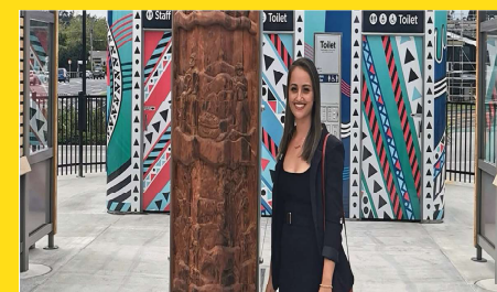
Hibiscus Bus Station opening