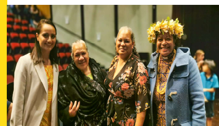
Fiafia day at Whangaparoa College Hibiscus Tuakana