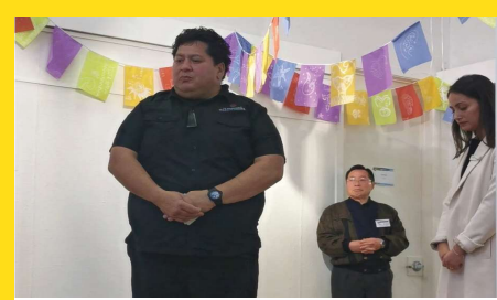
Hui Nga Tahī, Matariki, 30th Anniversary MAC Te Herenga Waka o Orewa