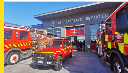
East Coast Bays Fire Station Opening