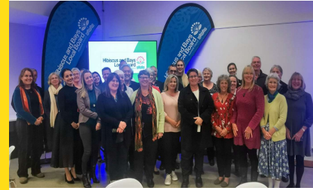
Hibiscus and Bays Volunteers Awards evening