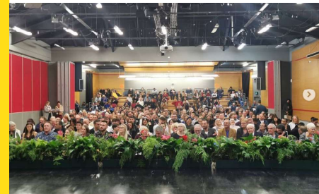
Citizenship Ceremony Orewa College