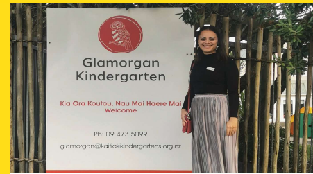
Ko Te Wai He Taonga: Water is Precious Celebration at Glamorgan Kindergarten