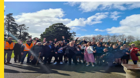
Taiāotea Stream Opening Sherwood reserve