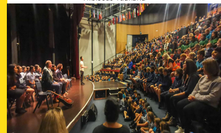
Fiafia day at Whangaparoa College